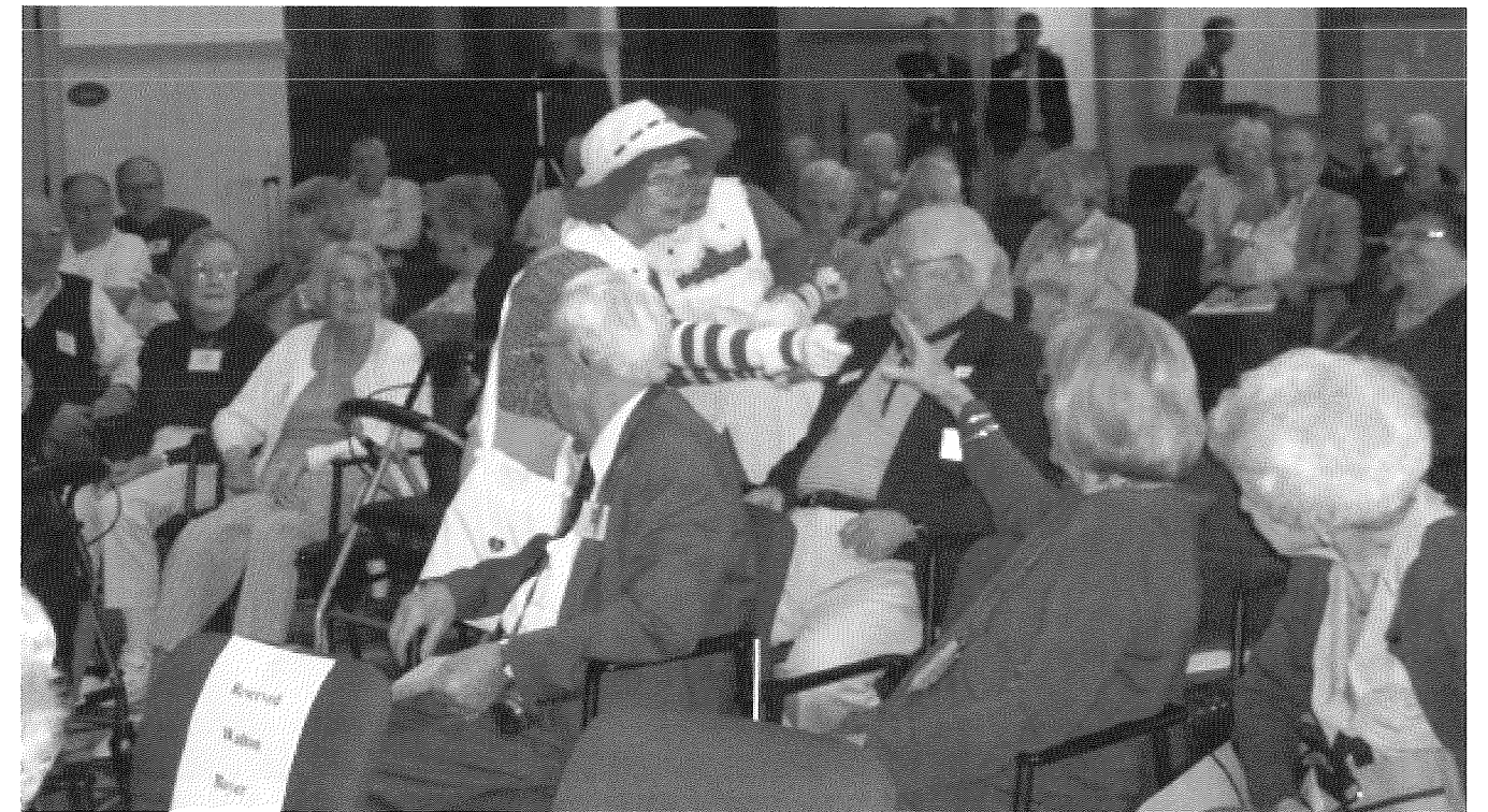
"Raggedy Andy" distributes door prizes.