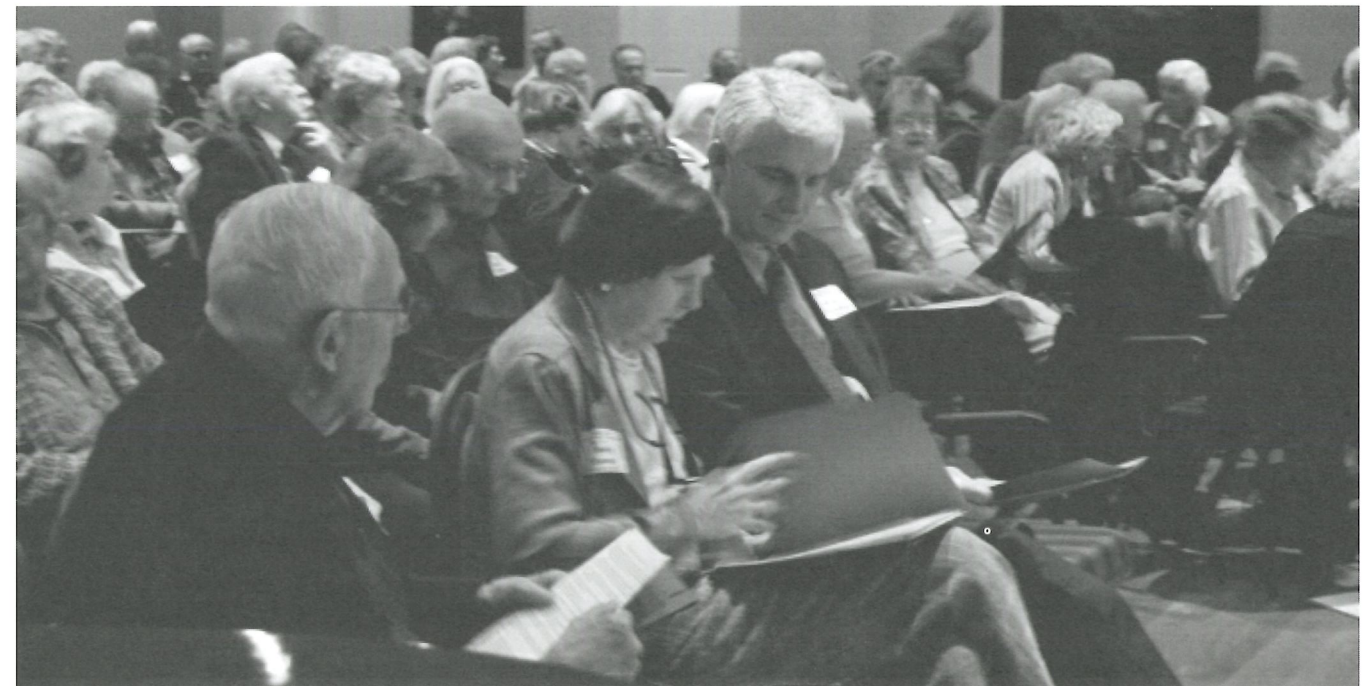
After registration and refreshments, attendees assembled in the auditorium.

The Residents' Association at Carolina Meadows, which is 25 years old, is recognized