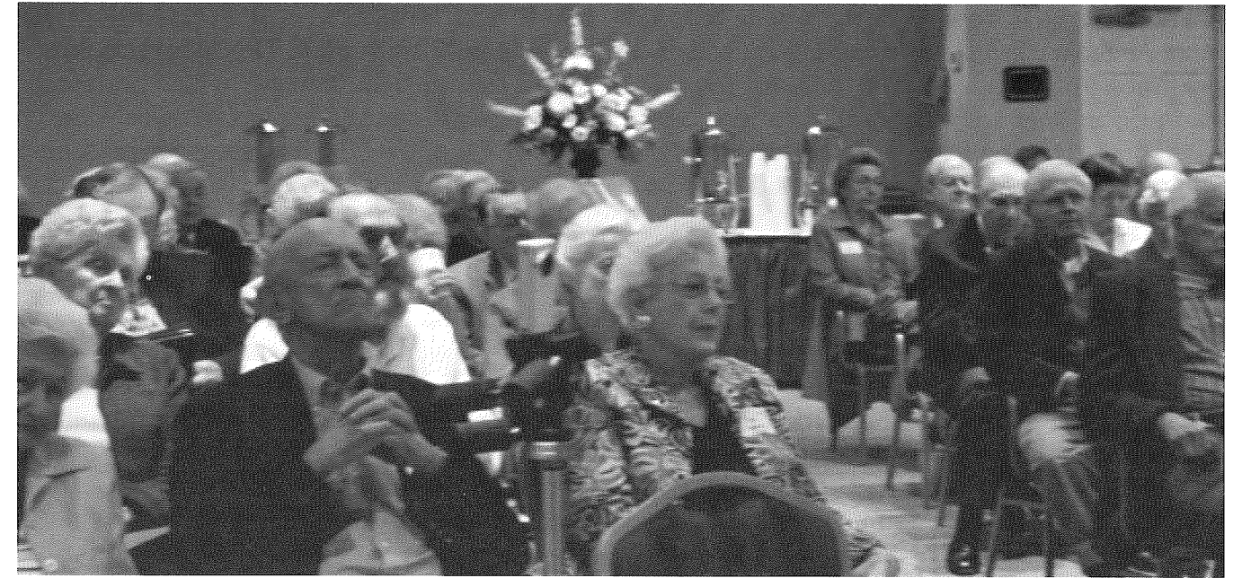
Audience listens to the presentations.

and works collaboratively with the association and residents. A residents' Budget and Finance Committee meets monthly with department heads and receives the same information. The four residents on the Board have full voting rights and are active in helping Board members understand the residents' perspectives. He said that the interaction between residents and staff is what makes Carolina Meadows seem like home.