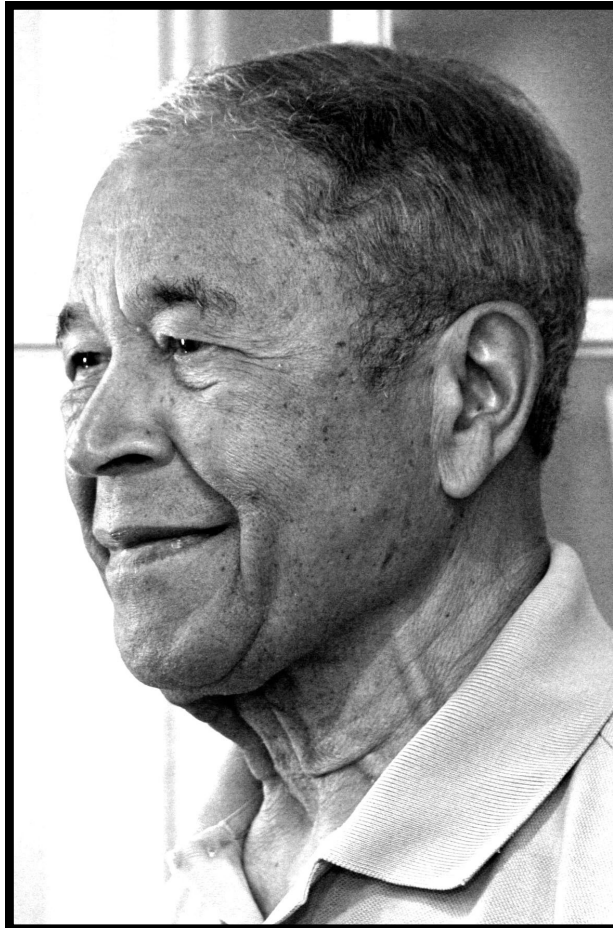
SEPTEMBER 4, 1921-AUGUST 24, 2013