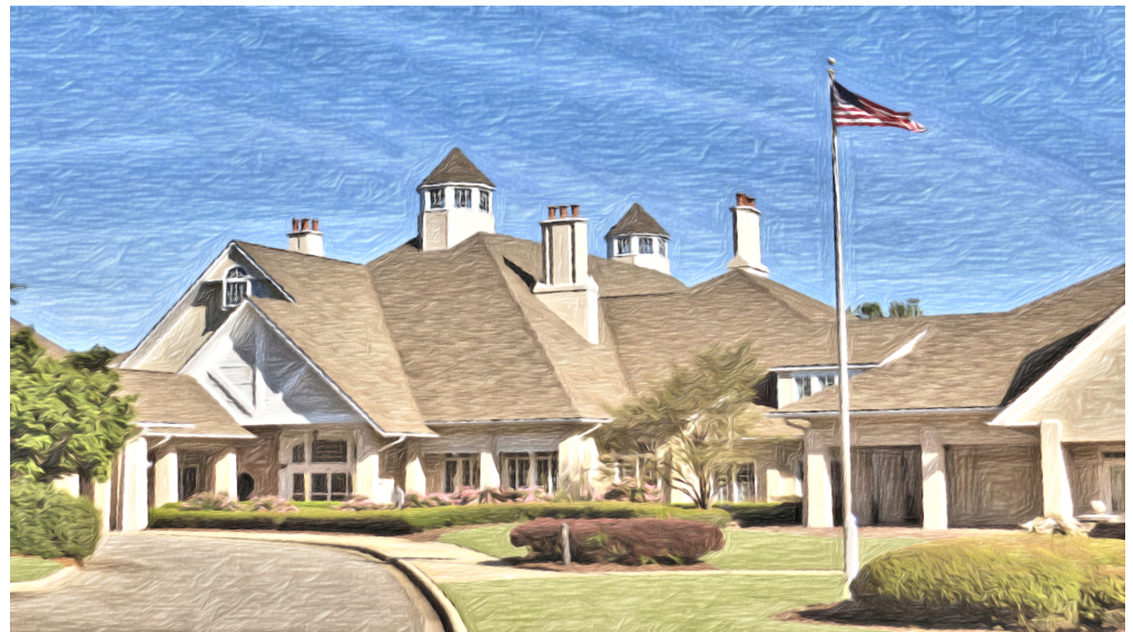
Belle Meade, Southern Pines NC

Meeting starts at 9:30 am, ending by 2:30 pm.